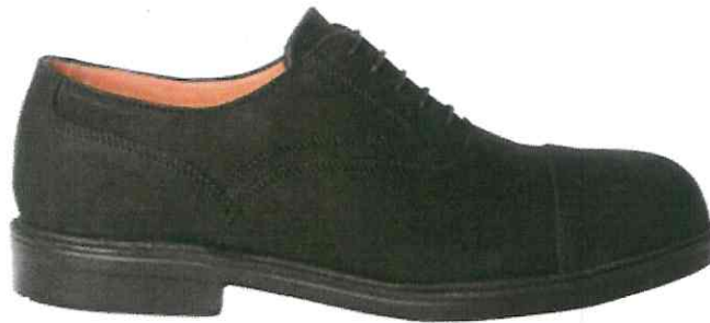
Redbrick classic Harvey